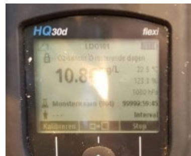
Sustained reading at end of drip line Dissolved Oxygen 10.8 mg/l Oxygen % 123.3% Temperature 21.5 C