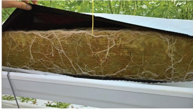
Root Systems of Tomato plants in hydroponic system without Phyto-Cat™ treatment.