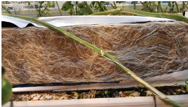
Root Systems of Tomato plants in hydroponic system with Phyto-Cat™ treatment.