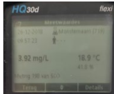
Immediatley After Phyto-Cat™ injection Time 9:57 am Dissolved Oxygen 3.92 mg/l Oxygen% 41.8% Temperature 18.9 C